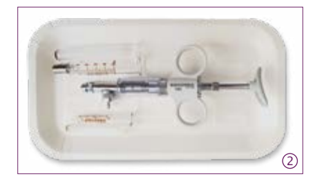
Flexibility ② A large variety of items can be sterilized, simply placed on rigid paper trays.